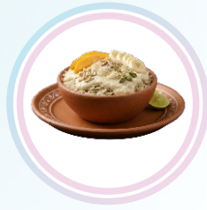
Dahi Chuda mix ( ½ cup)