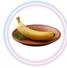
Fruit (1 medium)