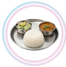
Rice (1 cup cooked) + dalma (¾ cup cooked) + cucumber