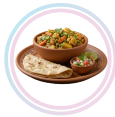
Vegetable Tarkari (1 cup) + roti (1 medium) + Koshala (raw salad, ½ cup)