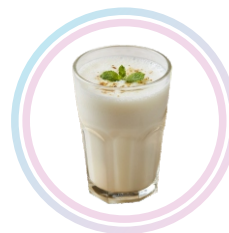
Chaas (1 cup)