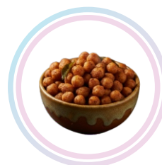
Roasted chana (25 g)