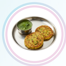
Besan chilla (2 medium)