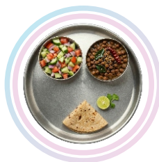
Ker sangri (1 cup cooked) + roti (1 medium) + salad