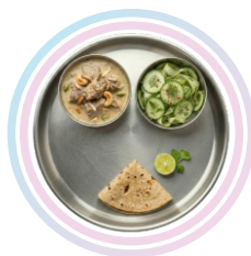
Safed Maas (80 g cooked) + roti (1 medium) + cucumber salad