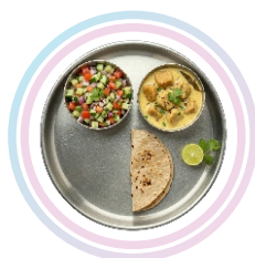
Gatte ki sabzi ( \frac{3}{4} cup cooked) + roti (1 medium) + Kachumber salad