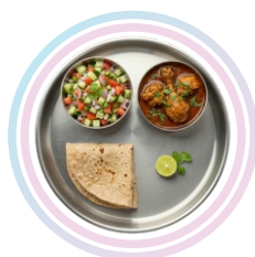
Chicken curry (80 g cooked) + roti (1 medium) + Kachumber salad