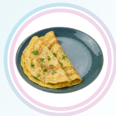
Egg chilla (2 medium)