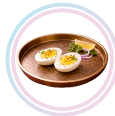
1 boiled egg