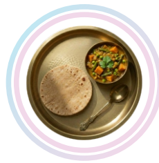
Seasonal kura curry (1 cup) + roti (1 medium)