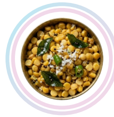
Sundal/Senagapappu usli ( \frac{1}{2} cup cooked)