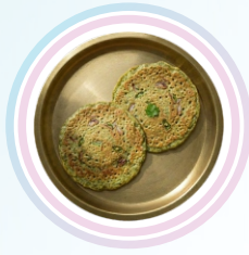
Pesarattu (2 medium)