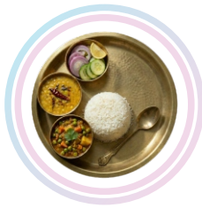
Rice (1 cup cooked) + dal ( \frac{3}{4} cup cooked) + kura (vegetable curry, 1 cup) + salad