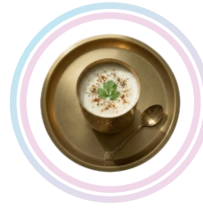
Buttermilk (1 cup)